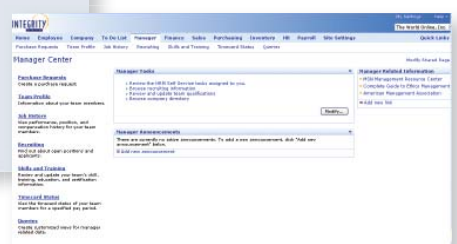
Rely on the powerful functionality and connectivity of Microsoft Business Portal.

Microsoft Dynamics GP provides the ERP functionality to coordinate calculation of payroll tasks automatically, even when employees work in different departments and at different rates during the same pay period. By making it easier to track applicant and employee information, Microsoft Dynamics GP can help healthcare organizations recruit and retain talented employees. In addition, self-service human resources capabilities reduce administrative costs by empowering managers and employees to make their own choices when appropriate.